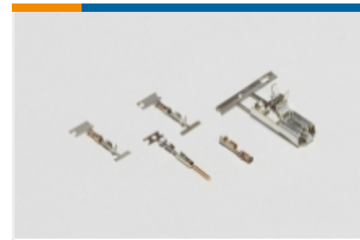
Wire-to-Board Connector Contacts(5)